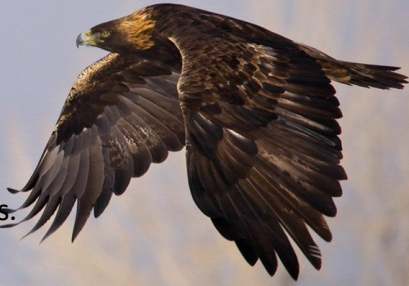
Golden Eagle