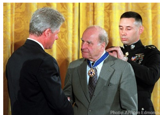
In 1995, President Bill Clinton awarded Senator Nelson the Presidential Medal of Freedom, the highest honor given to civilians in the United States, for his role as Earth Day founder.

Earth Day 1990 went global, mobilizing over 200 million people in 141 countries. This put environmental issues on the world stage, paving the way for the 1992 United Nations Earth Summit in Rio de Janeiro. Ten years later, Earth Day 2000 focused on climate change and clean energy. Approximately 5,000 environmental groups and 184 countries participated, reaching hundreds of millions of people. I wonder how we'll celebrate Earth Day 2020. We sure need to renew our efforts on Earth's behalf.