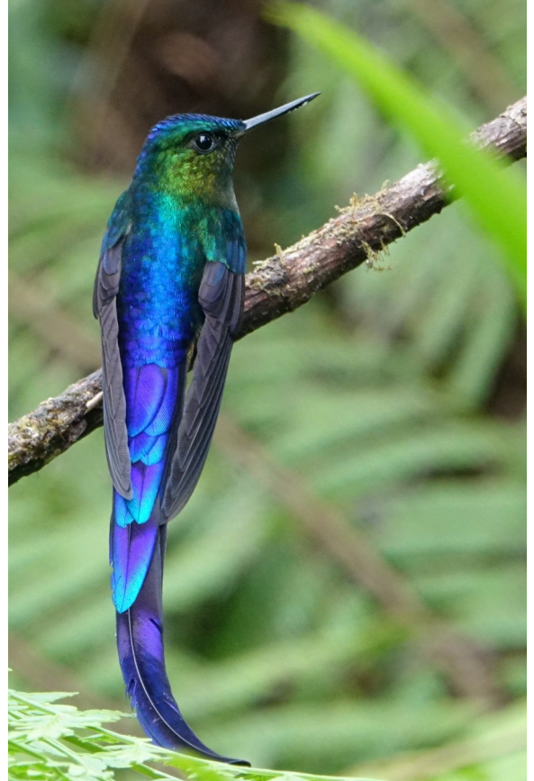
Violet-tailed Sylph, Las Tangaras Reserve, Colombia.