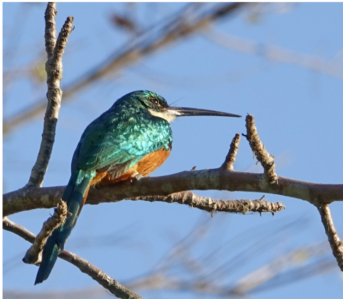
Rufous-tailed Jacamar, Minca, Colombia.