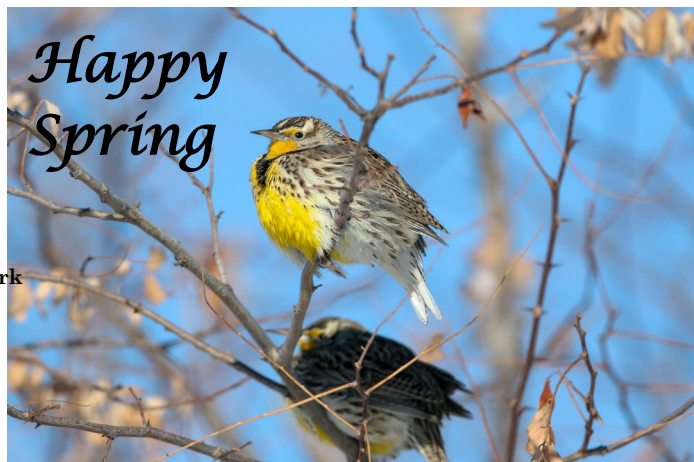
Western Meadowlark

FCAS welcomes new National Audubon Society members by sending one complimentary copy of our newsletter. Join us at our monthly programs on the second Thursday of the month to find out more about FCAS. National dues do not cover the cost of printing and mailing the newsletter, so if you'd like to keep receiving it, please support your local chapter and subscribe. See details on the last page of the newsletter or on our website at www.fortcollinsaudubon.org .