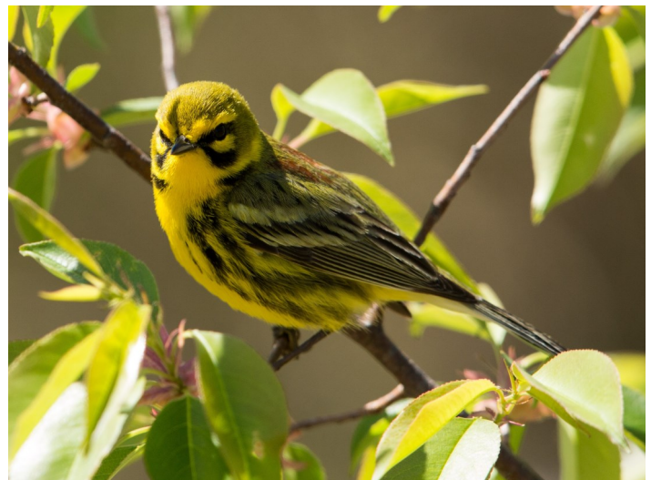
Prairie Warbler by Gary Robinette.