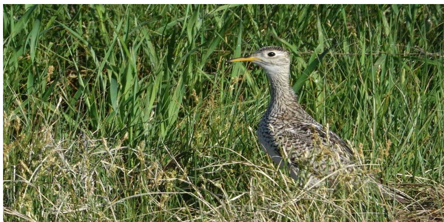
Upland Sandpiper photo by Stephen Jones.

Please check the FCAS website and Facebook pages for updates and information about the status of upcoming FCAS events.