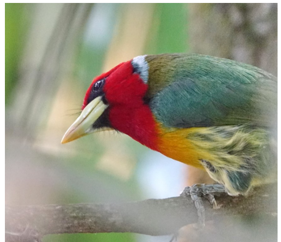
Red-headed Barbet, Jardine, Colombia.