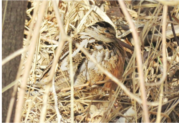
One local rarity shared through social media: the American Woodcock, at Bobcat Ridge.

sending email to the group. The group currently has more than 1,400 members who use COBirds primarily to spread the word on interesting or rare bird observations in Colorado. Anyone can apply to join the group. Best of all, anyone can view the messages posted on COBirds without even becoming a member. You only need to become a member to post your own messages. If you want to check out COBirds, go to the Colorado Field Ornithologists' website at http://cobirds.org/ and follow the link to the COBirds Google Group. You'll be able to find information