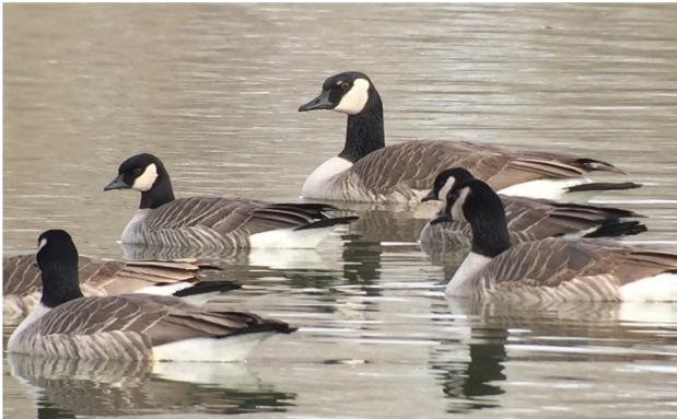
Identifying “white-cheeked geese” can be challenging: the Cackling Goose on the left has a shorter bill, shorter neck, and darker breast and is smaller than the Canada Goose on the right.