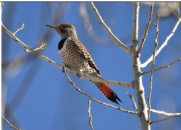
Northern Flicker, Douglass Reservoir

Jan. 1, Friday, Loveland CBC. See Page 3 for details.