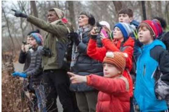
CBC participants

December and the holidays are here. This year, share some holiday spirit with the birds by participating in the annual Christmas Bird Count and by decorating a tree with edible ornaments.