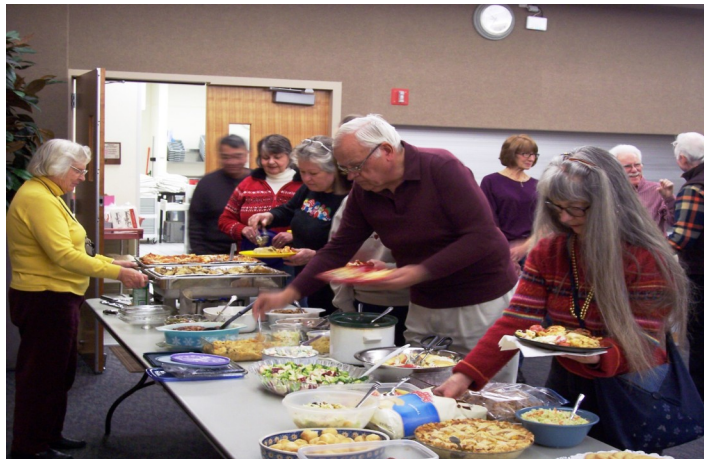
FCAS members and guests enjoying the potluck.

Our December program will be presented by YOU, our members and guests, who wish to share wildlife photos from your own photography collections in a slide show (please limit your slide presentation to 10 minutes). The Senior Center will provide the screen, digital projector, and sound system. You bring your photos.