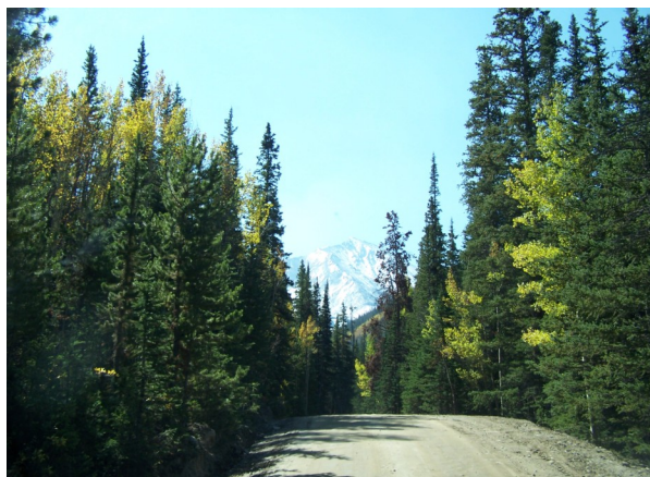
Colorado trees along the Bakerville Road west of Georgetown.

In addition, our new project, River Watch, is waiting in the wings for release. We are still negotiating our testing site with the sponsors. When that is done, we can begin offering you opportunities to learn about rivers and their significance in the community of life, and