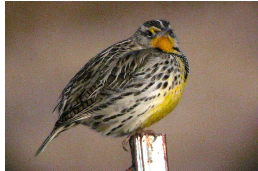
Western meadowlark